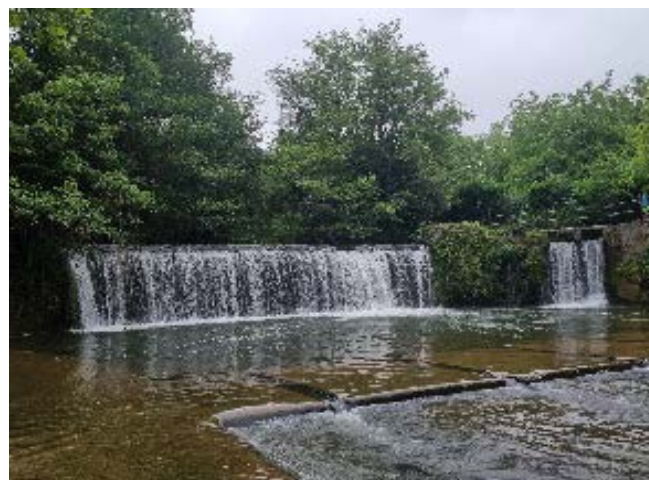
Evening excursion with the Notaries workshop to the waterfalls in Onati

I presented on the equality duties and its regulation in the UK specifically on the theme of lawyers and state transformation. I express my profound gratitude to everyone I met and who gave me helpful comments on my research to date in this area of law. I felt this helped me to develop my knowledge in my research field of legal professionals and understand the wider research communities view on Notaries across different jurisdictions. I hope to share my experience and knowledge with the overall research communities of the University of Warwick. I am also sharing this with professional contacts in specific industries such as (but not limited to) the legal industry in the UK. I have shared details on LinkedIn to grow presence among professional networks of the RC SL initiatives with wider audiences. Together, we are shaping the future of our industries and forging lasting connections.