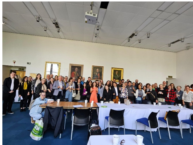
Group photo during the final coffee break

piece shown, the episode "A Study in Murder" (2008) of the Scottish TV series "Taggart", in which he also appears himself as the victim of the crime. The discussion was led by Peter Robson.