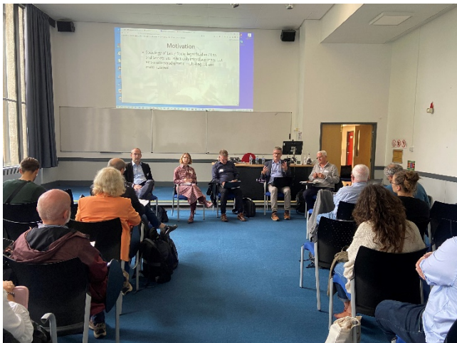
Presentation of the new WG