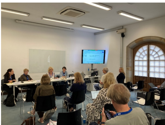
Panel "Women and Gender in the Legal Profession."

After the morning session, attendees received a tour of the IISJ and the San Miguel Church in Oñati, led by the Oñati office of tourism.