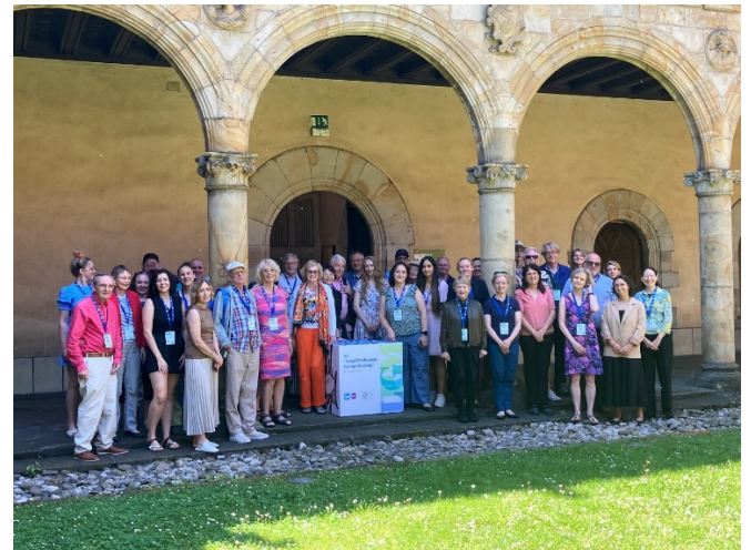
Attendees to the Legal Professional Working Group Meeting

The Meeting began with a Plenary Session discussing the new book "The Making of Lawyers' Careers: Inequality and Opportunity in the American Legal