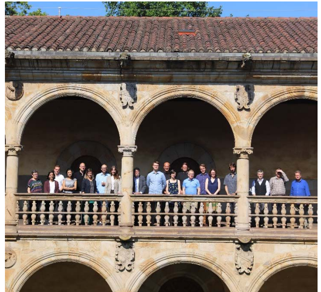
Workshop attendees at the IISL

Ombuds and Policy: The Case of Educational Field; The Ombuds and the Marginalized; Emerging Fields of Ombuds Activity; The Ombuds and Politics; The Role of the Ombuds: "Classical" Attributions and New Tasks; Effective Ombuds and Comparative Perspectives.