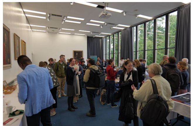
First coffee break