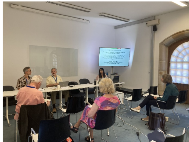
Panel discussion at the LPGM

with legal academics in different research field, experts, and visionaries, to explore innovative strategies and ideas to drive forward progress in our respective fields.