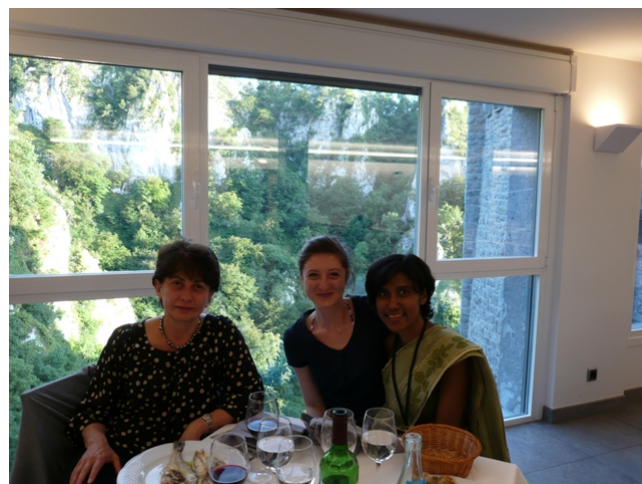
RCSL conference - 20 Years of IISL, Oñati Institute for the Sociology of Law, 2009

With this in mind we are looking forward to our first session at the 2025 ISA conference in Rabat, Morocco, titled "The Contribution of Legal Cultures to Our Understanding of Justice, in the Context of the Anthropocene." This session will explore how legal cultures provide frameworks for understanding justice in the Anthropocene, a period marked by significant human impact on the Earth. We aim to bring together diverse perspectives to examine the role of legal systems within their social contexts, highlighting themes such as environmental justice, human rights, and indigenous legal traditions. Scholars at different levels of their professional careers are invited to submit abstracts (300-500 words).