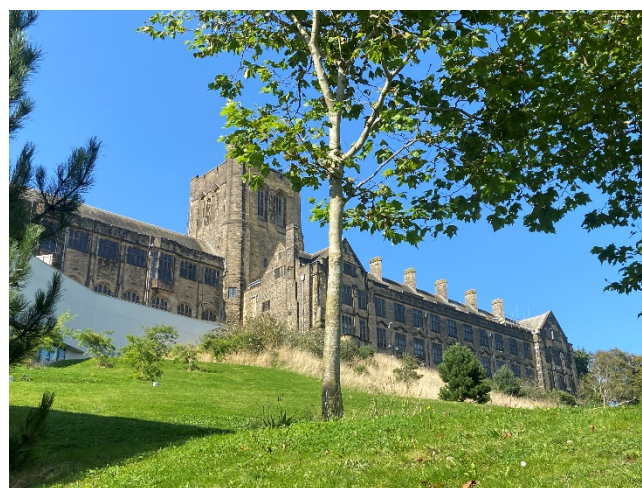
University of Bangor