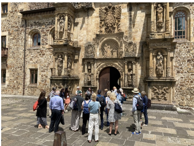
Participants touring the IISJ.