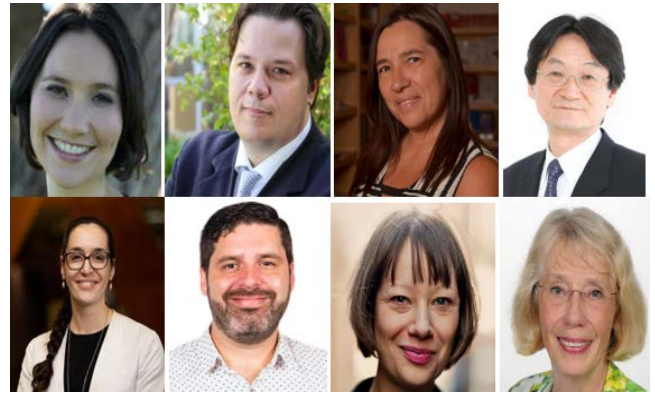
Members of the RCSL programme committee