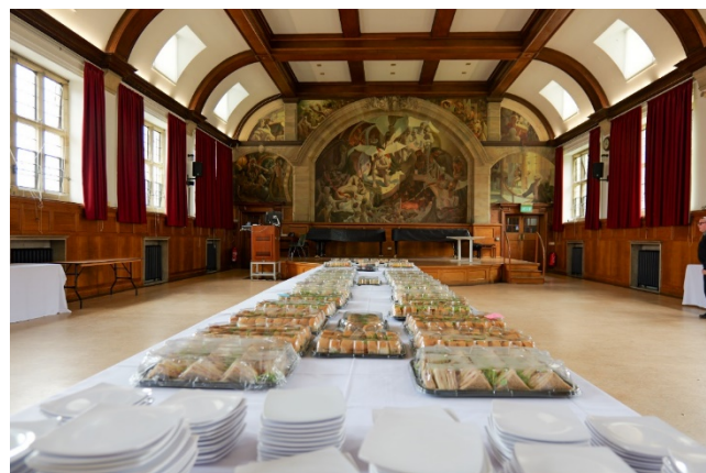
Lunch break in the historic Powys Hall of Bangor University.