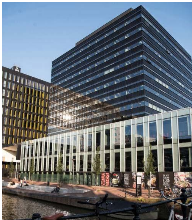
The impressive ACLPA building.

legal practice. The centre maintains a close relationship with legal practice, be it the judiciary, the Dutch Bar or the Municipality of Amsterdam.